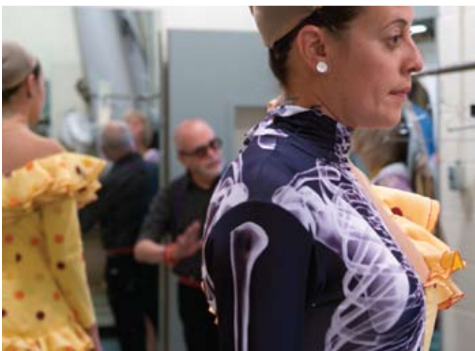
Closeup of the skeleton side of the costume.